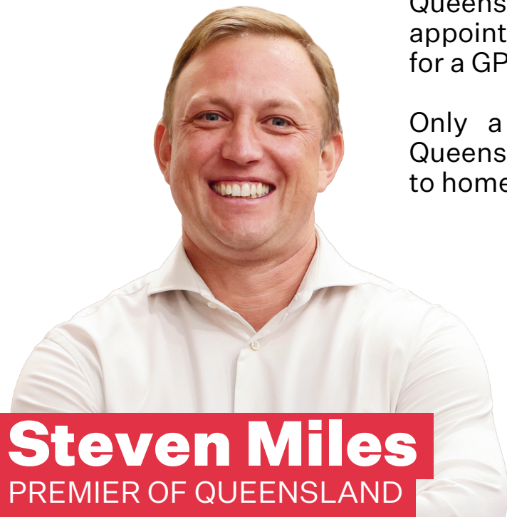
Steven Miles PREMIER OF QUEENSLAND

“Healthcare is a universal right. It's something Queenslanders should be able to access for free, no matter where they live.”